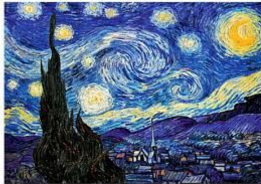
Starry Night by Vincent van Gogh

This week we are going to explore neighborhoods and our connections to them. How do people communicate in neighborhoods? How are we responsible for each other?